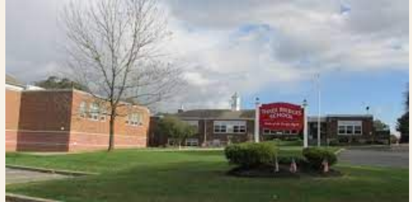
Three Bridges School