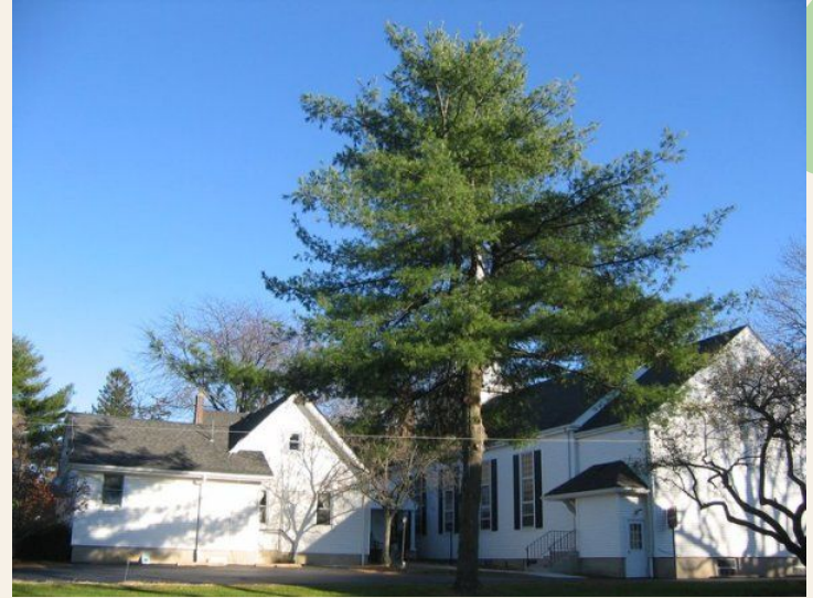
Stanton Learning Center